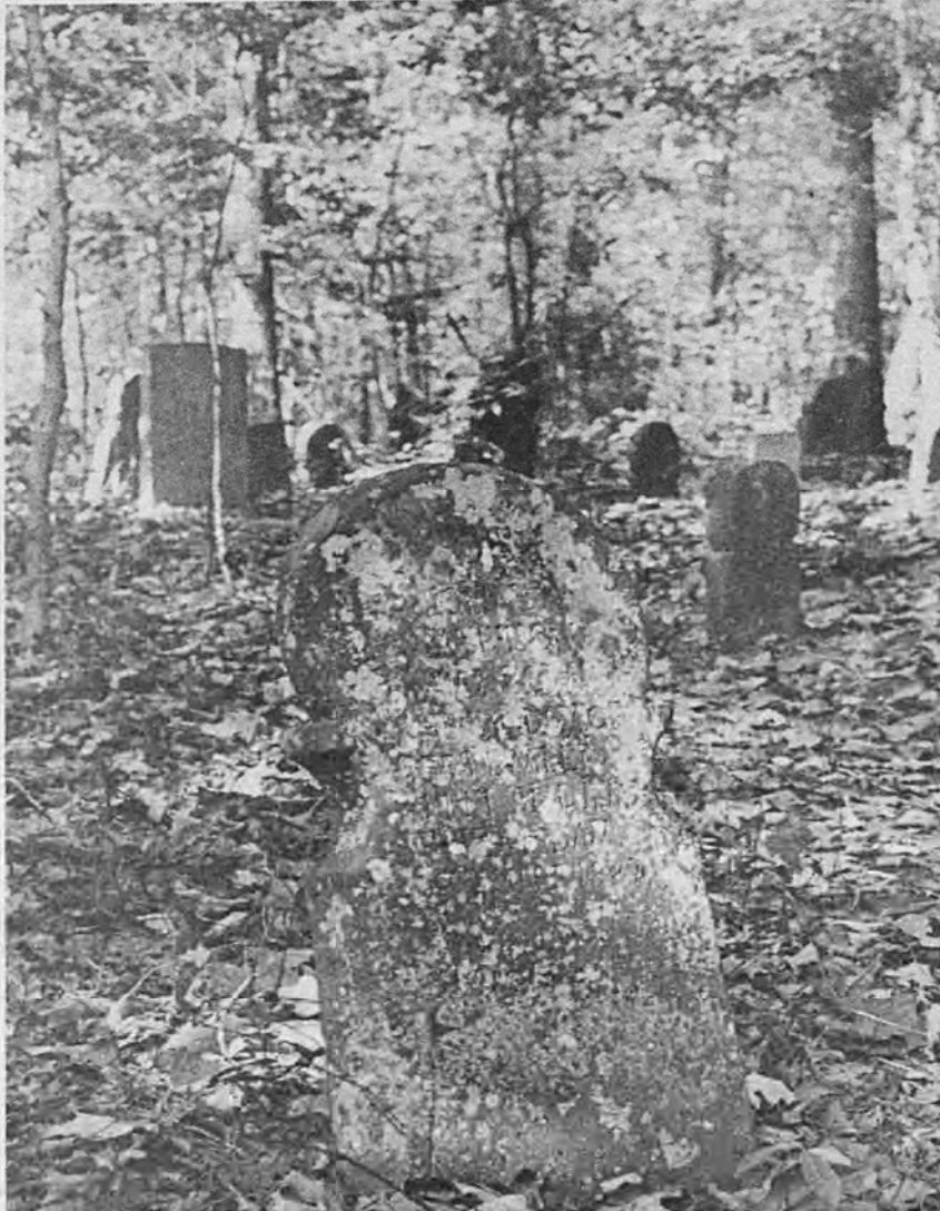
OLD SCOTTISH CEMETERY — A few visitors still go to the old Scottish Cemetery, near Mt. Carmel Church. The tombstone in the foreground (one of the oldest there) bears this inscription: "The sacred memory of John Pattison Was born the 14 day of September 1777 and Died the 11 day of June 1842."

(139) FM to 138 (?) 140 Small loose stone (141) FM to 140 (?)